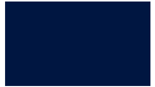
BLUE + TOURNAMENT PURPLE