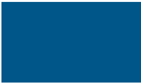
BLUE + ICE BLUE