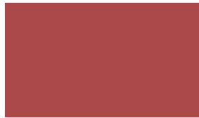
RED + YELLOW