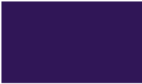
TOURNAMENT PURPLE + YELLOW