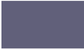
TOURNAMENT PURPLE + GRAY