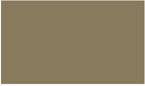
BEIGE + DOVE GRAY