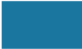
LIGHT BLUE + ICE BLUE