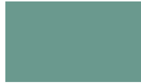
FOREST GREEN + ICE BLUE