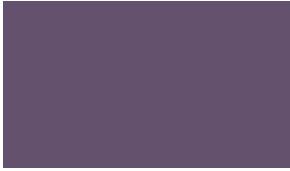
LIGHT BLUE + BRITE RED