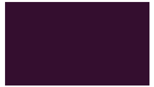
RED + TOURNAMENT PURPLE