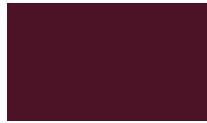
TOURNAMENT PURPLE + BRITE RED