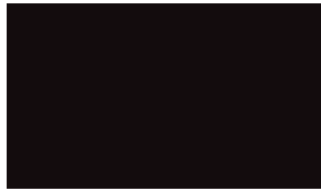
BLUE + BRITE RED