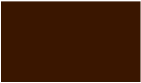
LIGHT GREEN + RED