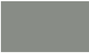
GRAY + DOVE GRAY