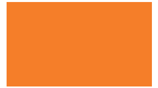
ORANGE + YELLOW