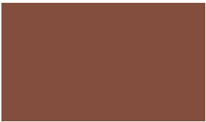
MAROON + YELLOW