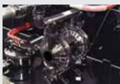
Dual Diaphragm Material Pump