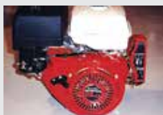
GX390 Honda Engine