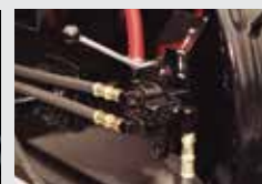
Direct-Drive FWD/REV Agitation