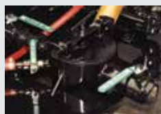
One Gallon Basket Strainer