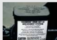
Safety Break-Away Braking System