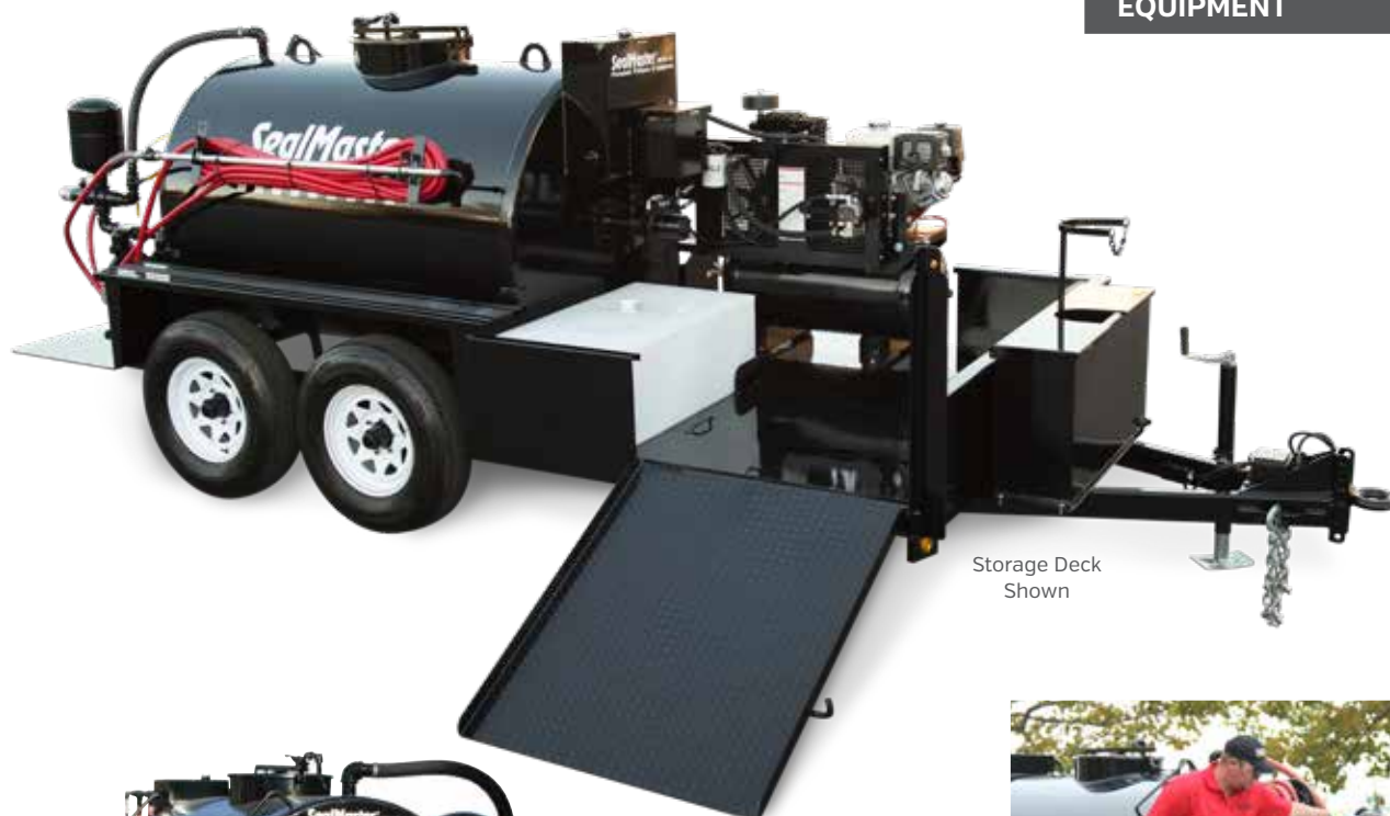
Storage Deck Shown