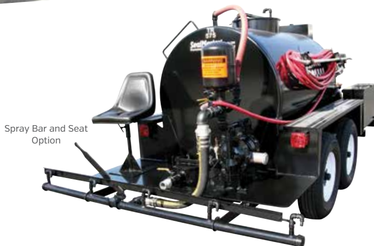
Spray Bar and Seat Option