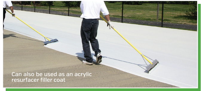
Can also be used as an acrylic resurfacer filler coat

For use as an acrylic resurfacer: .07 to .09 gallon per square yard per coat